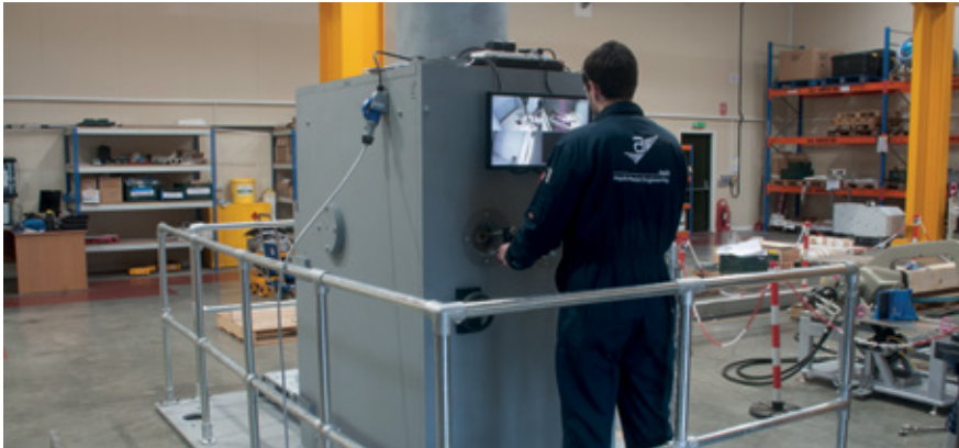
Operating position with viewing employing COTS camera and Monitor